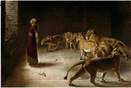
Daniel in the Lion's Den (Daniel 6)